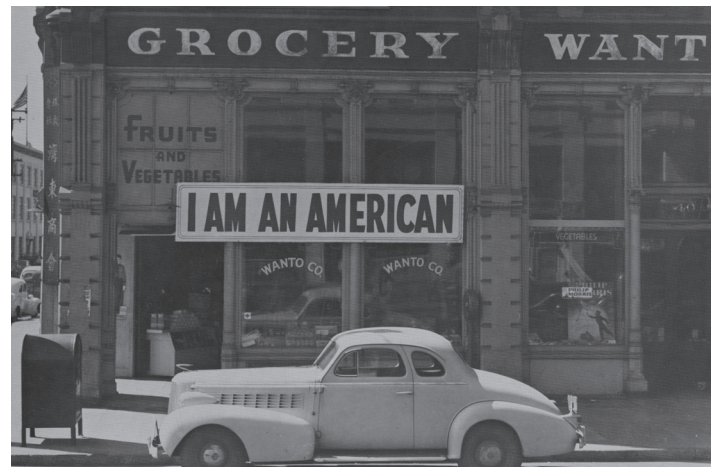
An original "I Am An American" sign that was displayed during WWII. The sign will serve as the centerpiece and focal point for the traveling exhibition.

The Nation Museum of the United States Army and the National Veterans Network (NVN) is currently seeking personal objects to include in the exhibition that will represent the Nisei Soldier's "I Am An American" theme. Personal artifacts and archival documents are integral to this storytelling exhibit approach. Photos, letters, diary entries or any items that show the Nisei Soldier expressing their identity as an American is of great interest during this time of discovery as the exhibit design unfolds.